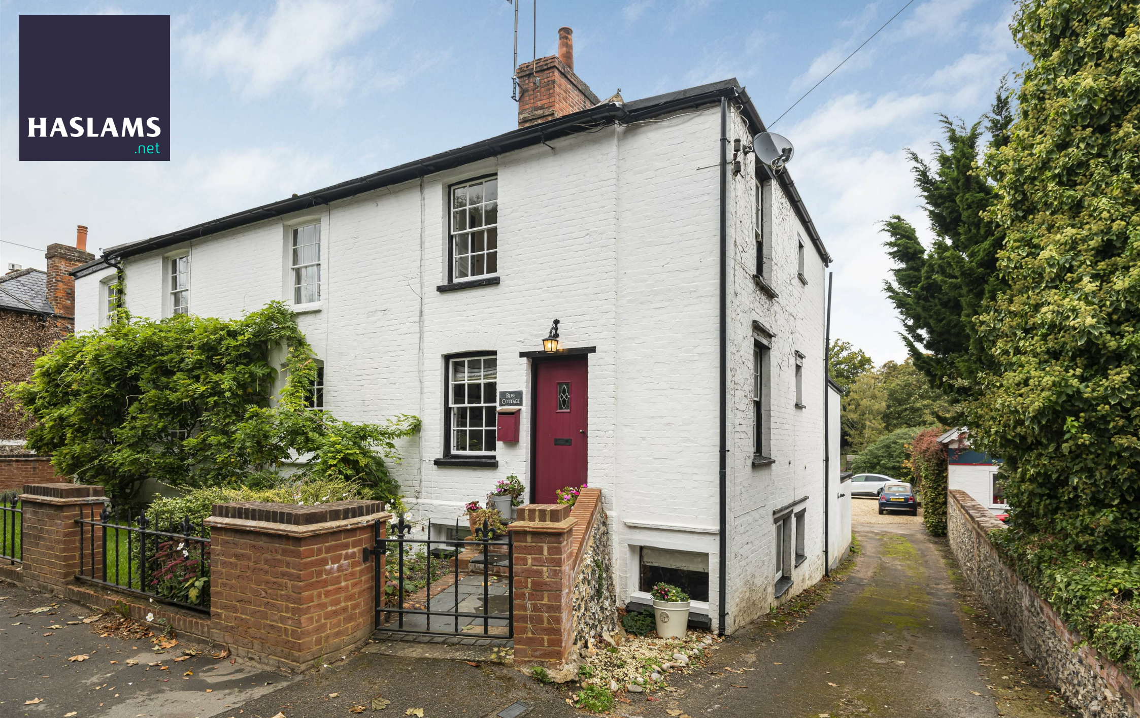
Rose Cottage, Remenham Hill, Henley-On-Thames, RG9 3EP